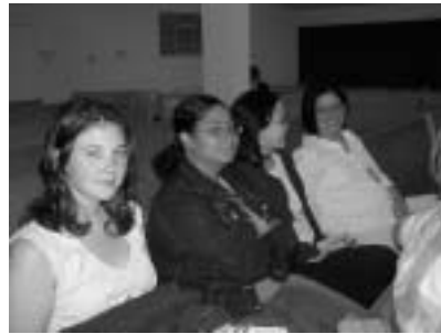
All photos © Farah Mokhtareizadeh, unless otherwise noted