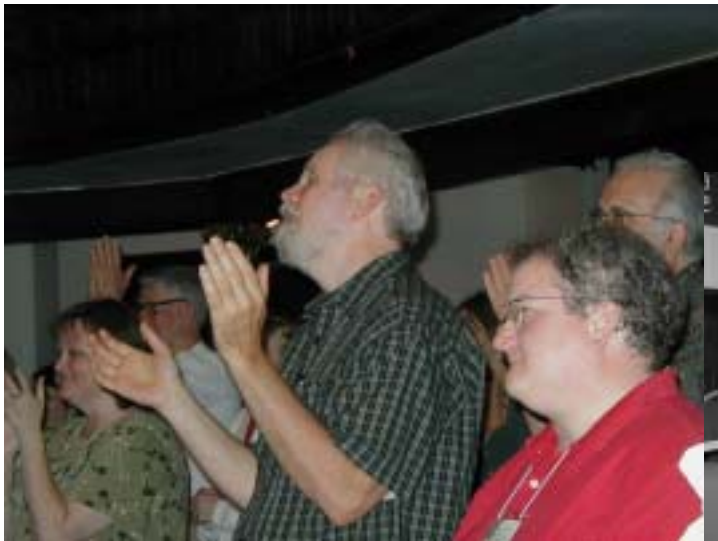
Wednesday night worship