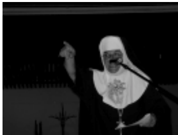
The Comedy Nun